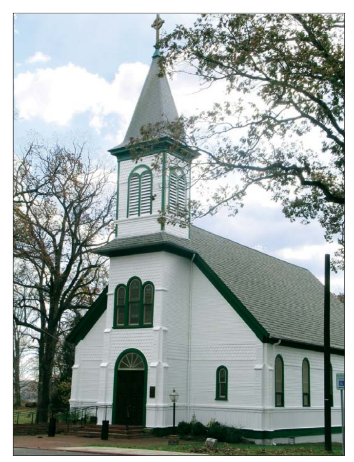
National Historic Register: St. Ignatius Catholic Church on Brinkley Road.

The Broad Creek Historic District was designated in 1985 by action of the Prince George's County Council. It was the first historic district created under the county's historic preservation ordinance and it establishes financial benefits to owners who restore or maintain their properties consistent with its guidelines. The district has an advisory committee that reviews proposed alterations, additions, or new construction within the district and makes recommendations to the Historic Preservation Commission. The boundaries of the historic district (the 2002 Broad Creek Historic District Preservation Planning Study ) is to expand the boundaries of the historic district after other objectives for the district are accomplished.