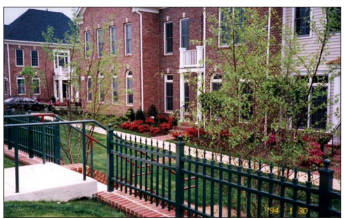
Low fence establishes boundary.

Policy 3: Ensure that development is safe and comfortable for residents and visitors through the application of Crime Prevention Through Environmental Design (CPTED) principles.