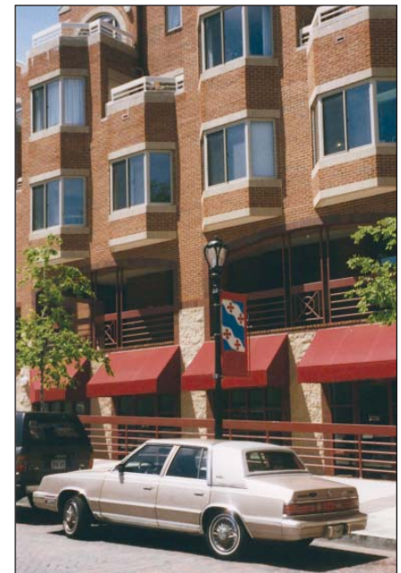
Vertical mixed-use building.

Policy 1: Promote pedestrian- and transit-oriented design principles in moderate- to high-density centers, corridors, and mixed-use activity centers.