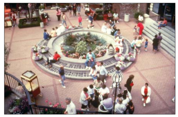
An example of a public gathering space that provides amenities to encourage safety, relaxation, and comfort.